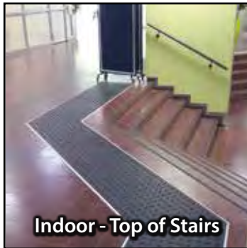
Indoor - Top of Stairs