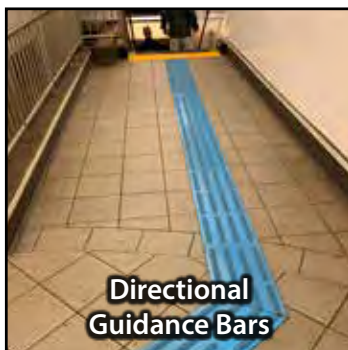
Directional Guidance Bars